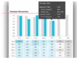
Dwelling / Occupancy Analysis