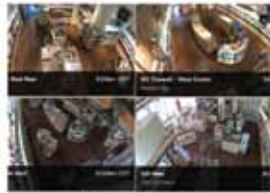
Multiple Sites / Stores Comparison