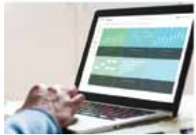
Detailed / Personalized Reports