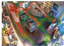
Visual Insights (Heatmaps)